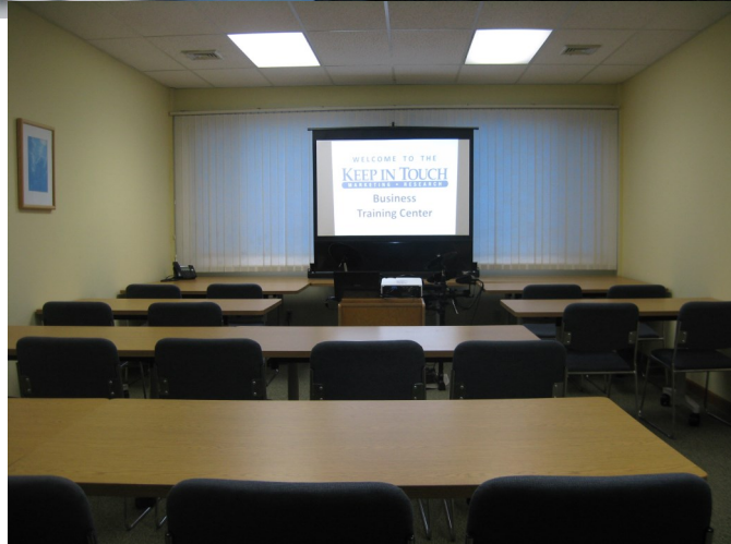
Classroom configuration fits up to 20 people.