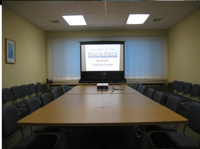
Conference room configuration fits up to 30 people.